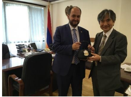
June 25 th Minister of Education and Science Harutyunyan