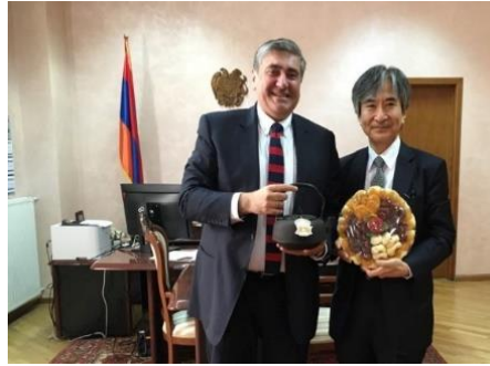
June 21 st Minister of Agriculture Khachatryan