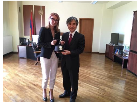
July 11 Minister of Labor and Social Affairs Tandilyan