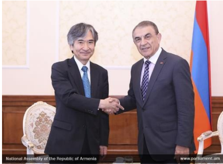
June 26 President of the National Assembly Babloyan