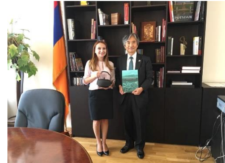
July 17 Minister of Culture Makunts