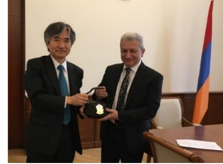
June 26 th Minister of Finance Janjughazyan