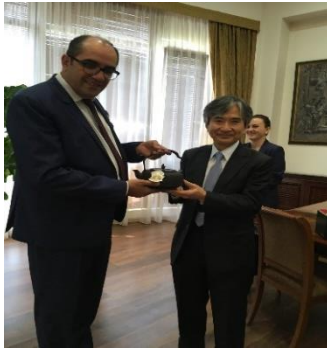
June 14 th Minister of Emergency Situations Rostomyan

Since the appointment, Ambassador Yamada has paid a courtesy call to the Prime Minister Pashinyan's cabinet ministers etc.