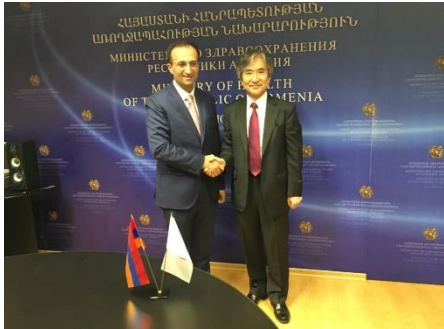
July 11 Minister of Healthcare Torosyan