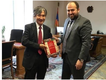
June 19 th Minister of Nature Protection Grigoryan