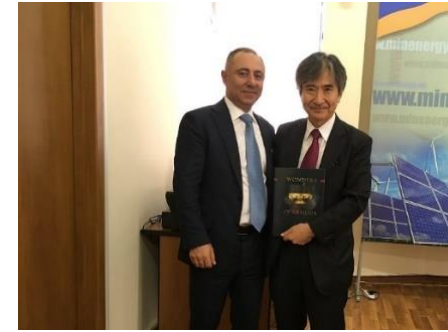
June 19 th Minister of Energy infrastructures and Natural Recourses Grigoryan