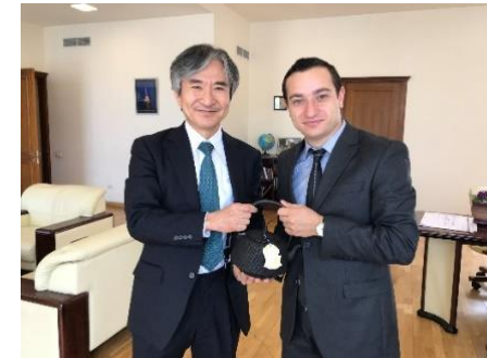
June 20 th Minister of Diaspora Hayrapetyan