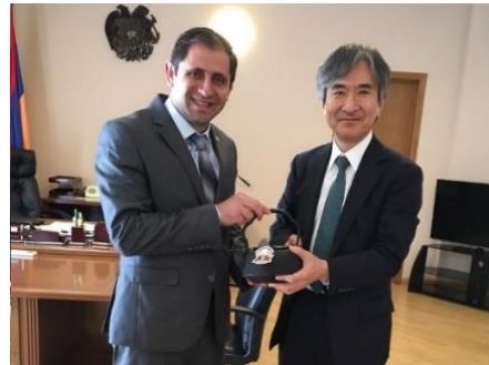
June 20 th Minister Territorial Administration and Development Papikyan