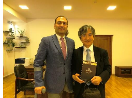
July 4 Minister of Justice Zeynalyan