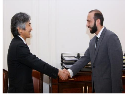
August 10 First Deputy-Prime Minister Mirzoyan