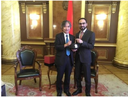
August 16 Deputy Prime-Minister Avinyan