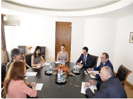
August 1 Minister of Economic Development and Investments Minasyan