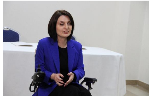
Congratulatory address by Ms. Zaruhi Batoyan, Minister of Labor and Social Affairs