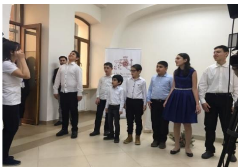
Louse children's choir performing songs by Komitas