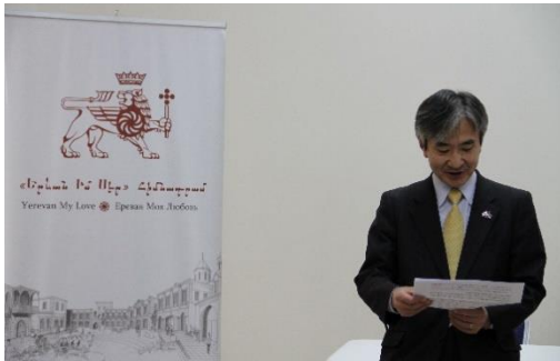
Congratulatory address by Ambassador Yamada