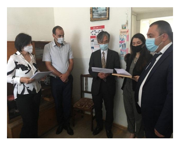
Congratulatory Address by Ambassador Yamada