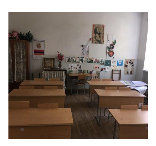
The New Desks and Chairs for the Schoolchildren of Azatek Secondary School