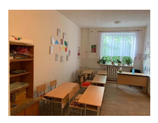
One of the New Fully Equipped Classrooms