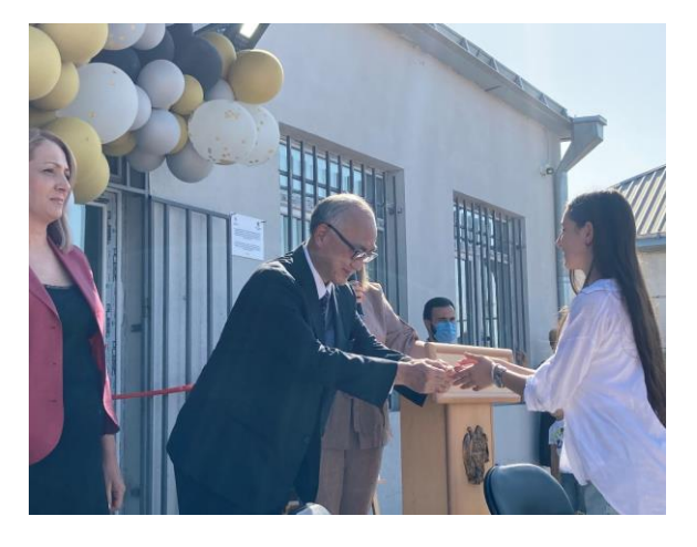
Handing over student cards