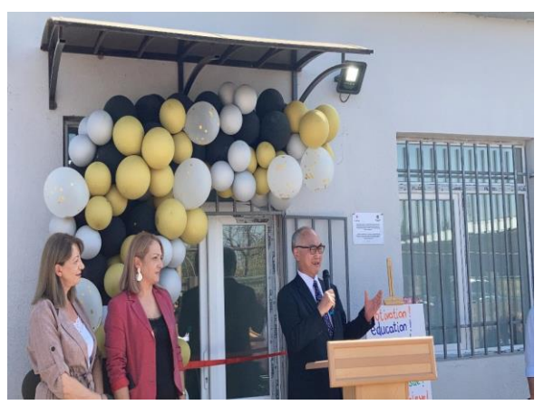
Congratulatory address by Ambassador Fukushima