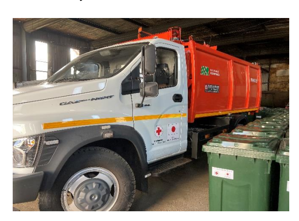
The Garbage Collection Truck and Waste Containers provided through GGP