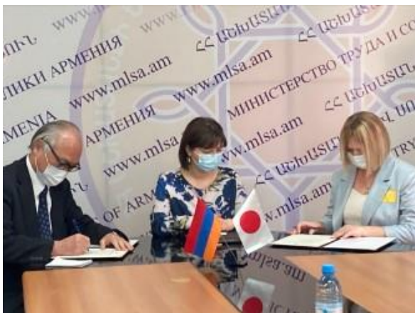
Signing of the Grant Contract