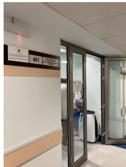
A room where the provided equipment are installed