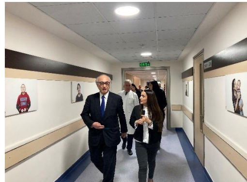
Tour in the Center