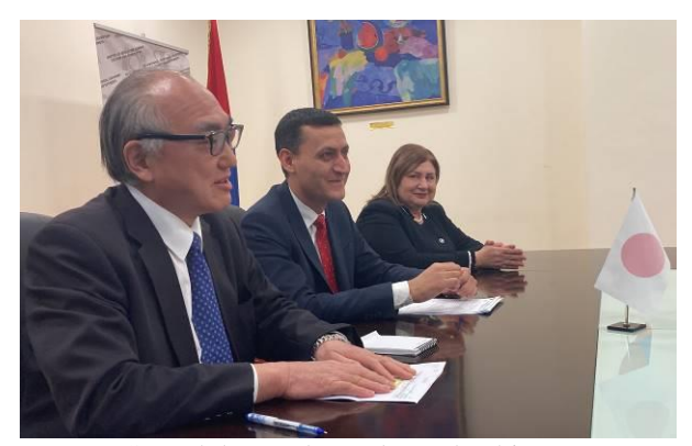
Speech by Ambassador Fukushima

The Project aims to improve learning environment of No.5 Kindergarten of Armavir Municipality and further contribute to increase the quality of education as well as the standard of living in the City by renovating the building and installing heating system. As a result, approximately 190 children will benefit from the Project.