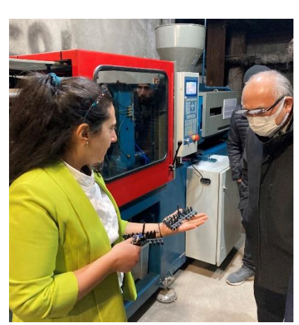
Produced piece of stationary (pen cap)