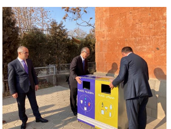
Installation of the sorting bin (from left, Governor Hovhanissyan, Ambassador Fukushima and Mayor Khudatyan)