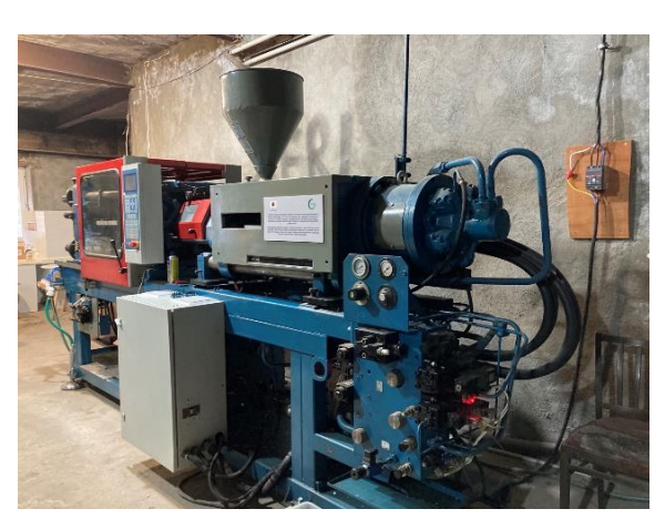
Provided molding machine