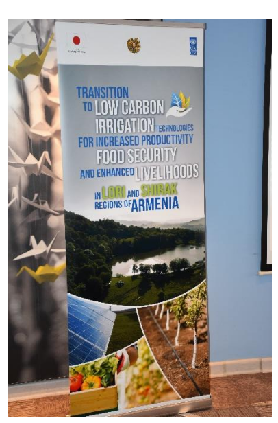
Banner of the Project