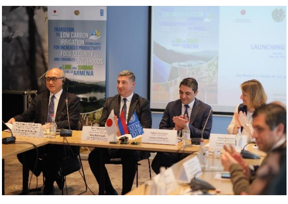
Speeches by Participants