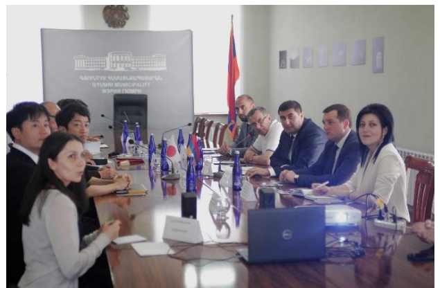
Participants in the meeting between mayors