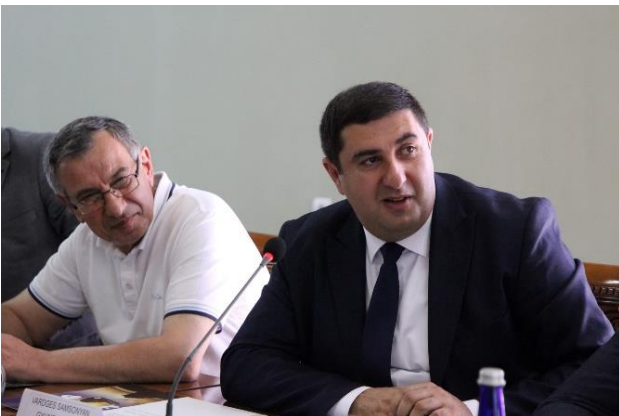
Mayor Samsonyan at the meeting