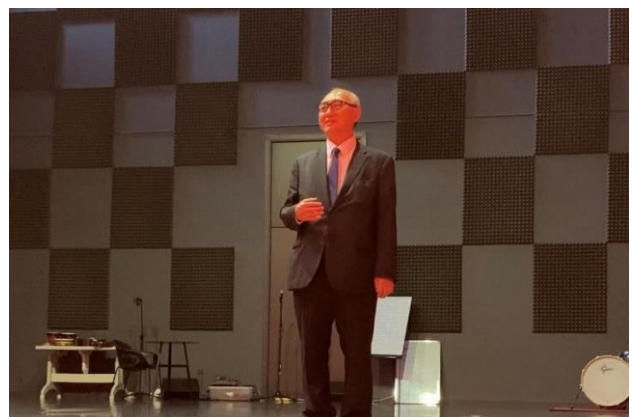
Ambassador Fukushima interacting with children of TUMO Gyumri