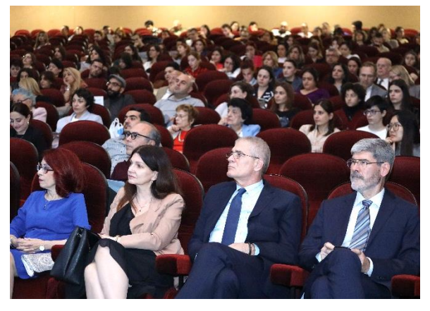
Film Festival in Yerevan