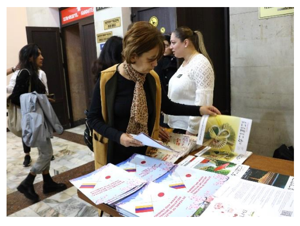
Film Festival in Yerevan