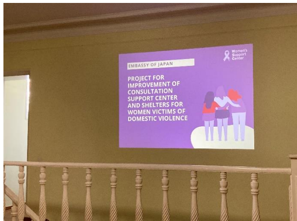
Presentation on the Project