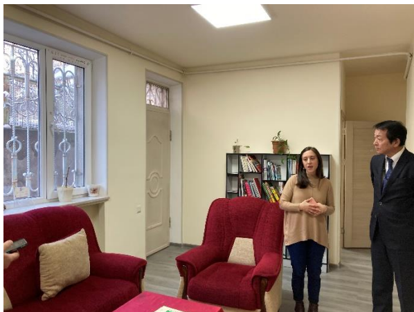
Tour of the Consultation Support Center

This project was implemented with the aim of contributing to improve the safety and living environment of the consultation support center as well as shelters for women victims of domestic violence through renovation of some parts of the buildings, and provision of essential furniture. As a result, approximately 300 people will benefit from the project each year.