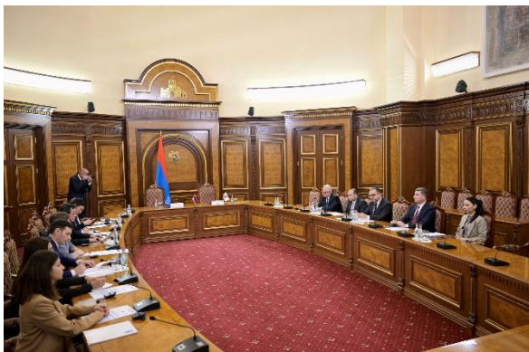
Participants of the Signing Ceremony

In particular, this initiative is a follow-up to the USD 2 million Emergency Humanitarian Assistance for the displaced persons of Nagorno-Karabakh, that was provided by Japan in October last year. This is expected to reduce the economic burden on the host communities, provide assistance to the displaced persons, including many vulnerable groups such as women and children, and promote social integration between the host communities and the displaced persons, thereby contributing to the stability and improvement of the humanitarian situation in Armenia.