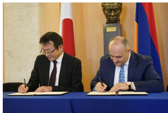
Signing of the Grant Contract