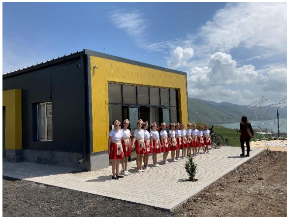
Welcome with traditional Armenian dance

The project was implemented with the aim of diversifying local industries and increasing the income of local residents. Approximately 450 residents will directly benefit from the implementation of this project annually.