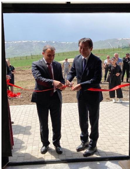
Red tape cutting