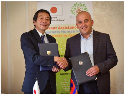
Ambassador Aoki and Deputy Mayor shake hands after signing the grant contract

This project aims to improve the water supply infrastructure in Tashir, Lori Province, by rehabilitating and enhancing a 15km section of the water pipeline. As a result of the project, approximately 12,300 residents in 11 villages of Tashir Community, including about 700 displaced persons from Nagorno-Karabakh, will have stable and continuous access to drinking water. This will significantly improve the quality of life for local residents and reduce the economic burden on the displaced persons.