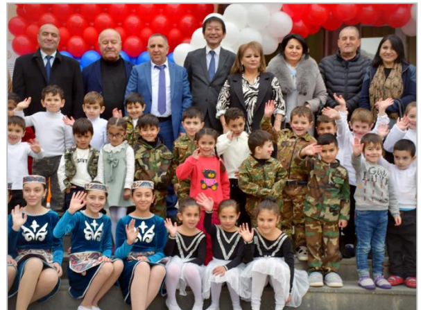
Group photo with the stakeholders