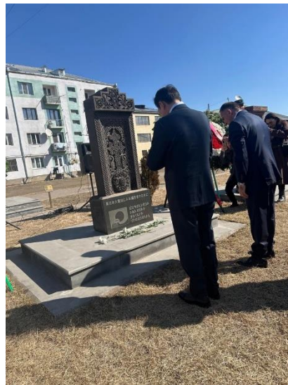
Great East Japan Earthquake Memorial