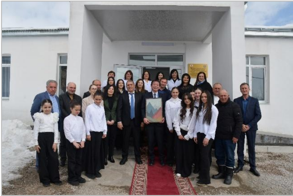
Group photo of attendees